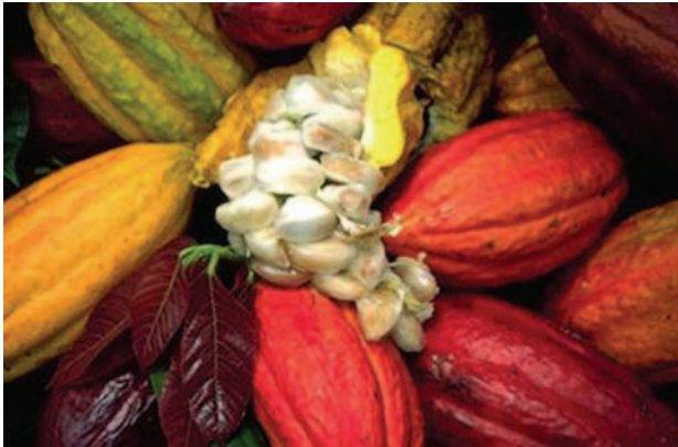
Figure 2. The fruit of the theobroma cocoa tree.

Therefore, careful distinction between in vitro and in vivo effects of flavanols is mandatory. For example, although procyanidins are biologically active in vitro , they are hardly absorbed in the intestine and thus are largely inactive in vivo .